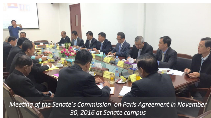
Meeting of the Senate's Commission on Paris Agreement in November 30, 2016 at Senate campus

agreed on the draft law and decided to bring to the upcoming plenary meeting of the Senate.