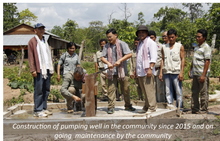
Construction of pumping well in the community since 2015 and on going maintenance by the community

Villagers, including the head of the Community Protected Area (CPA) committee, the village chief and some of the heads of households emphasized that the water system